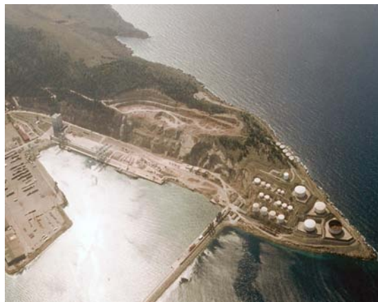
Volujica in years 1933 and 2011: the degree of devastation is clearly seen

Gradually, Volujica is disappearing, and in places where the stone is quarried large ugly scars are occurring in the form of bare karst, which first strikes the eye when entering Bar with the highway from the direction of Sutomore. But the problem is not only that of aesthetics. As contemporary ecology interprets, everything in nature is linked in cause-effect relationships, and the destruction of one ecosystem necessarily entails a series of impacts on other ecosystems.