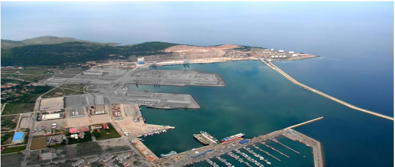
View of Volujica from the direction of Sutomore

The Volujički cliff with its hinterland has several times been the subject of bare land afforestation in organised activities in the period from the forties to the eighties of the twentieth century, and until the quarry was opened this locality was the habitat of black pine and cypress, and on the rims of Volujica there was Aleppo pine. Macchia is replaced with evergreen trees of conifers in the foothill, and among the plant species there is a significant number of vulnerable macromycetes 5 . The faunal value was represented in the jackal - golden jackal, which the rocky hills suit best, but because of habitat loss, both it, like rabbits, partridges and Mediterranean sunbleak, completely disappeared from the area where the quarry operations began.