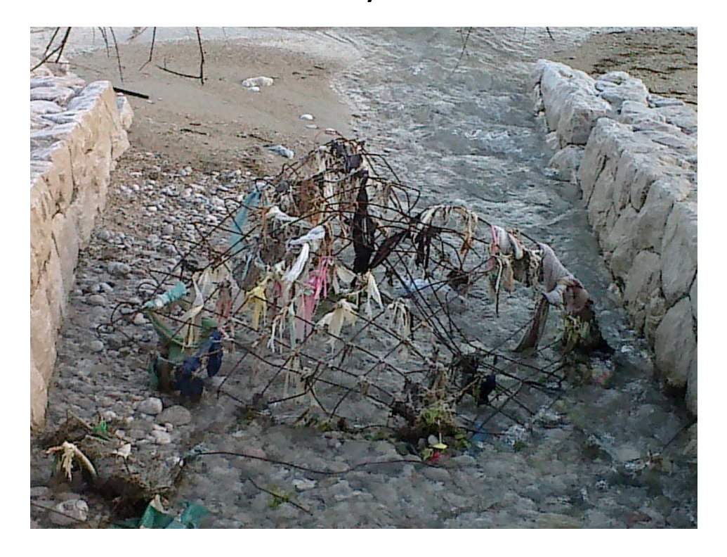
Our town is full of trees, seaside town, become our shame One of the cleanest beaches today is the garbage dump