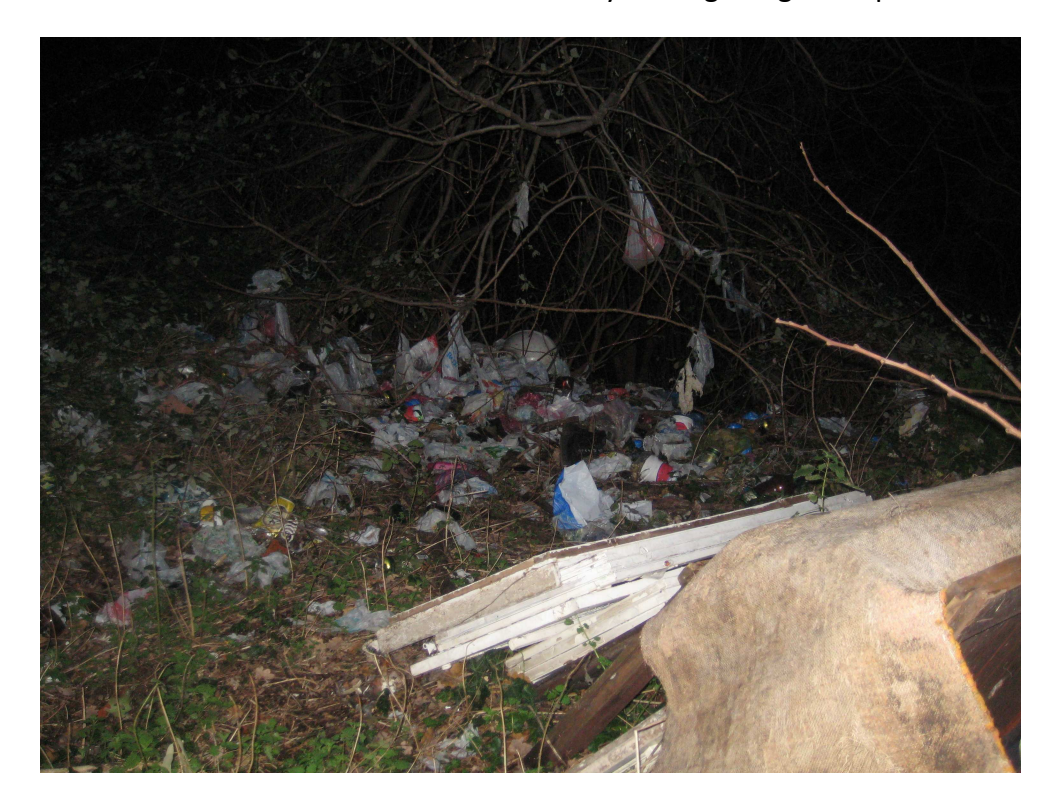
The green "Dubrava" also is facing people's negligence.